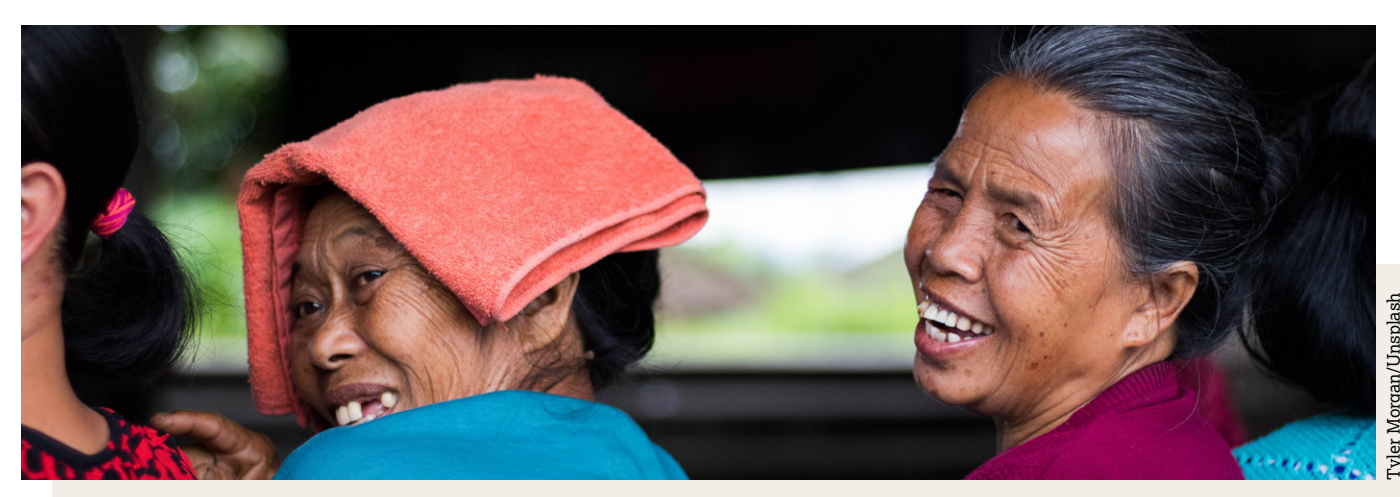
10% of the Indonesian population were over the age of 60 years in 2019.

The Strategic Plan of the Ministry of Health 2015–2019