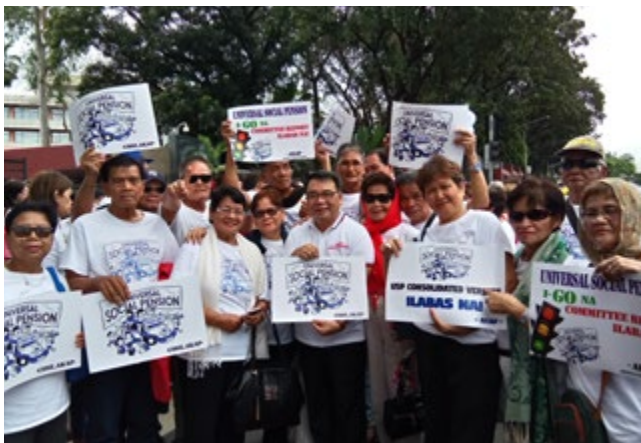
Coalition of Services for the Elderly

“Being a member of the HelpAge global network allows us to be the part of a worldwide partnership and to have input into the international movement for change that’s aimed at putting the rights of older people on the global agenda.”