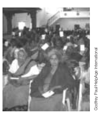
Token distribution of relief. India.

Those planning reconstruction are asked not to assume that older people have families or access to social services which will provide them with support. They should quantify the economic contribution of older people by including them in livelihood assessments. This would help identify their livelihoods before the disaster and their needs and options in the future. In addition any policies which might involve the relocation of traditional fishing communities must consider the lack of alternative livelihood options and the long-term impact on community structures.