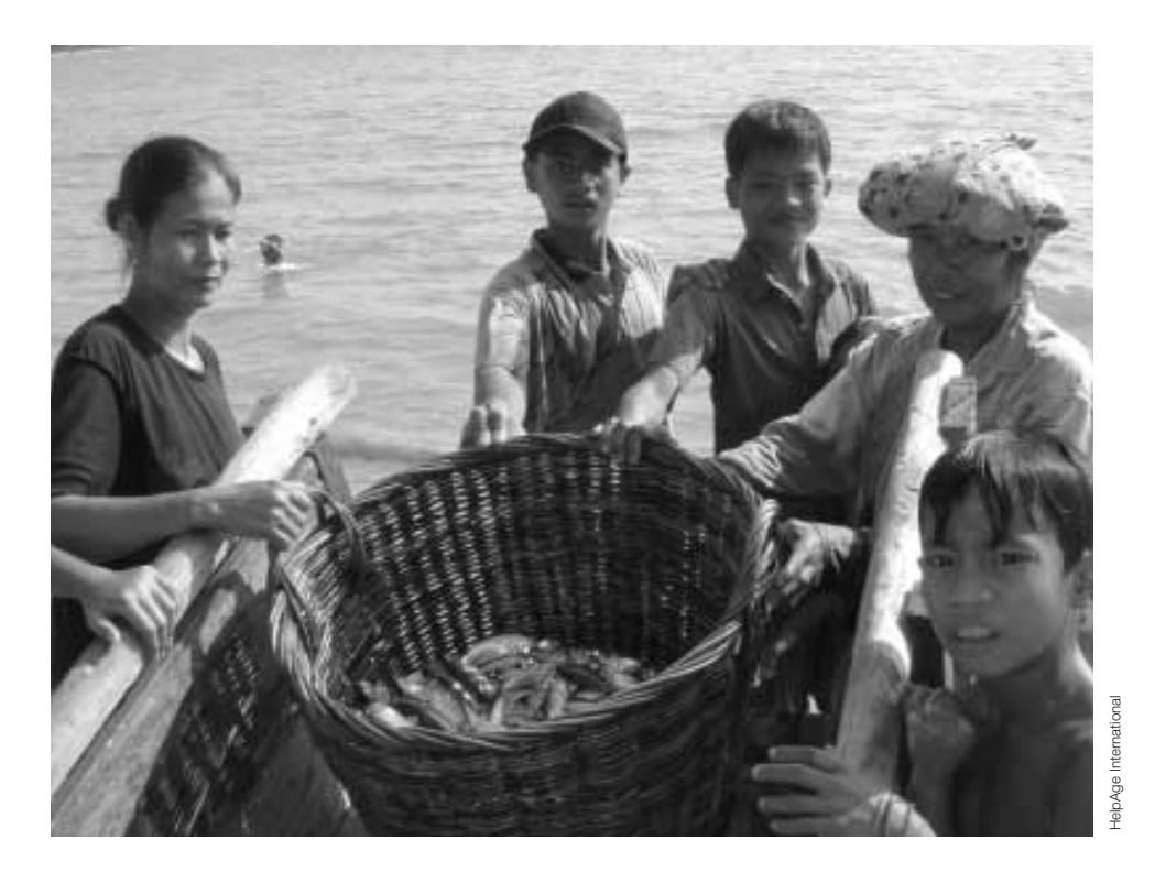
Kupamma, 65, Relief Camp, India

Older survivors sought help in obtaining social pensions, where these already existed, or access to short-term relief payments. The possibility of a regular cash income, however small, provides critical support for older people, especially older women, who are among the poorest. The particular health problems that older frail people encounter in an emergency were not adequately addressed, for example, treatment for chronic diseases and psychosocial problems.