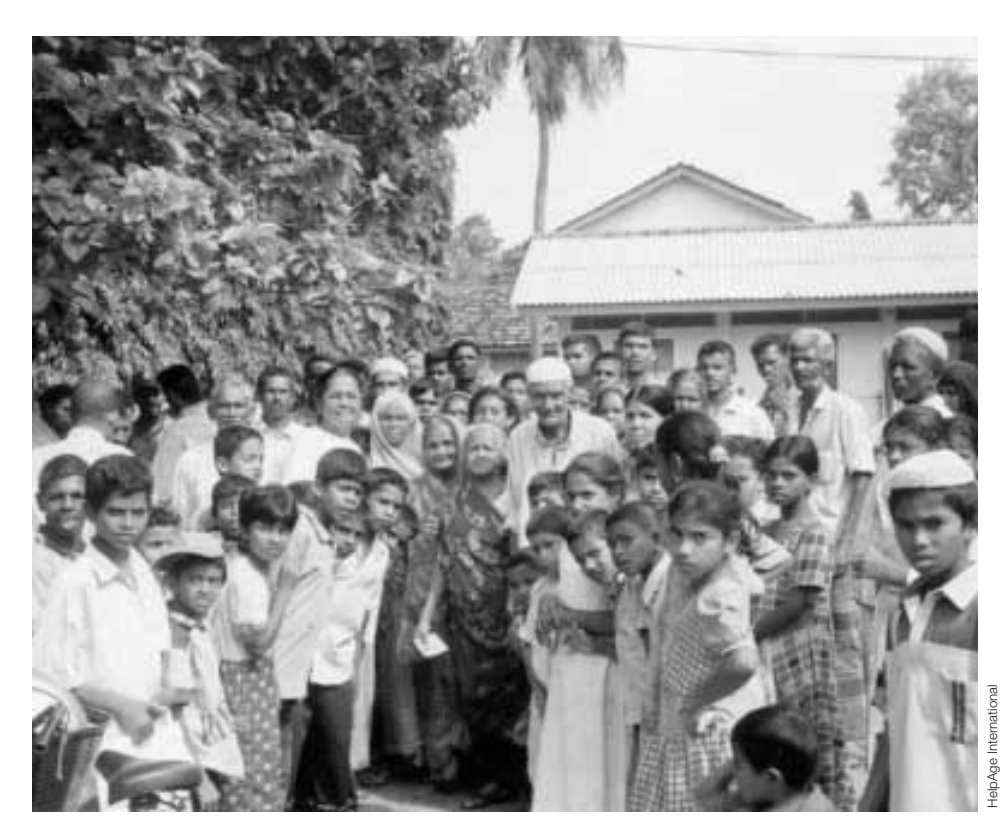
Older people and their families at a camp in Sri Lanka

In Sri Lanka, four of the camps in Batticaloa had committees made up of residents who helped in camp operations. However no measures were taken to ensure older people were included. In India researchers noted that no serious efforts were being made to involve older people in the activities of the camps. They were considered as recipients of help and not active contributors. Those who did contribute were those who took the initiative to help.