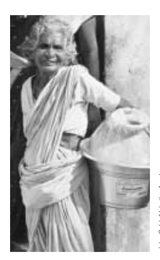
Older woman with her relief supplies, India.

The Department of Census and Statistics in the Weligama Divisional Secretariat of Matara, Sri Lanka collected disaggregated data on gender and age before and after the tsunami, which allowed for a more accurate analysis of the tsunami casualties.