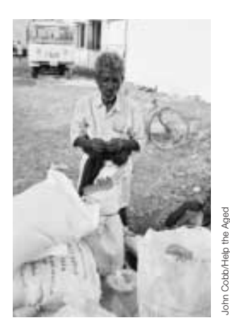
Older man sorting donated clothes. India.

In Kerala, India, a pension scheme organised by the state fishing cooperative (Matsyafed) has been in place since the mid-1980s. The scheme allows fishermen to contribute a nominal amount to their fishing cooperative pension account till the age of 60 years. This contribution entitles them to a regular monthly pension after that age. The existence of this scheme meant that even when the older fishermen lost most of their belongings in the disaster, they still had some assured monthly income to act as a safety net.