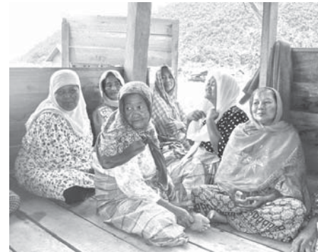
Older people organised in Banda Aceh, Indonesia

The contents draw on the experience of working with OPAs in several countries, including Bangladesh, Cambodia, China, India, Indonesia, Lao PDR, Sri Lanka, Thailand and Vietnam.