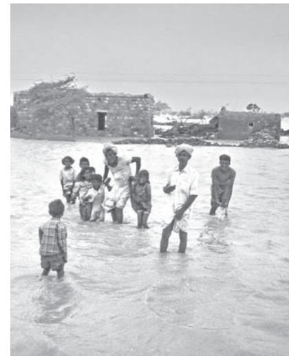
Rajasthan floods in 2006

Community workers can work with older people and other community members to identify and prioritise hazards. Older people in particular will be valuable