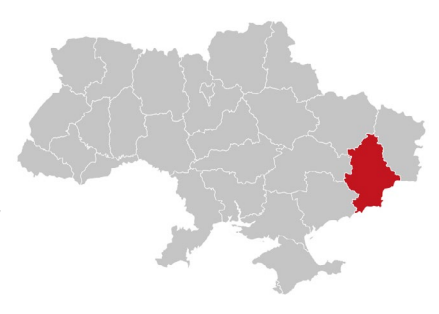
Map of Ukraine showing the Donetsk Oblast in red

(1) to significantly improve access to humanitarian assistance and protection for older men and women, including those with disabilities that were affected by the conflict in Eastern Ukraine.