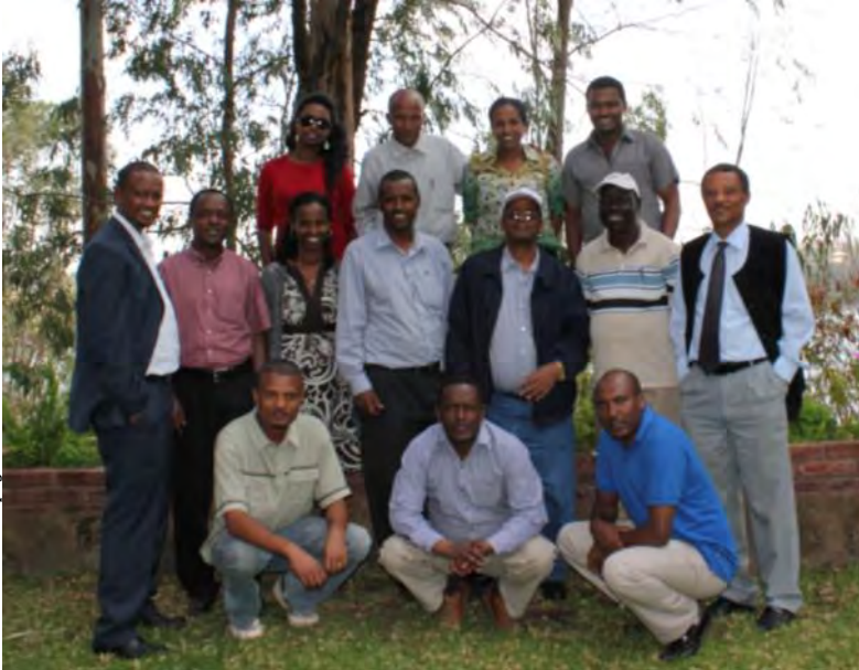
Erna Mentenot Hintz/HelpAge International/2013