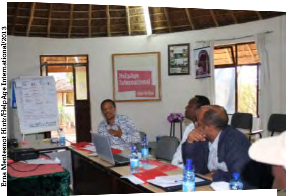
An overview of the four programmes areas in light of their respective key policy issues, key areas of action and key priorities is available in the table on page 9.

The first two days were allotted to the strategic review of programmes and resource development in the presence of top management and the senior programme staff, and was concluded by planning the future direction of the HelpAge programmes.