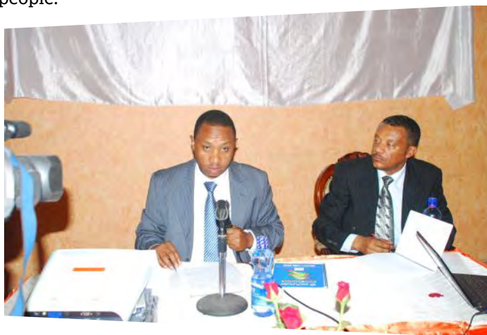
Left: State Minister, H.E. Mr Ramadan Ashenafi, speaks during the Inter-ministerial Coalition Forum for the Implementation of NPAOP in March 2013.

In close collaboration with the Ministry of Labour and Social Affairs, HelpAge International organised two break-through workshops revolving around the situation of older people and social protection policy in Ethiopia. With vital significance in building the capacity of members of parliament as well as governmental ministries and agencies, the national workshops aimed to contribute towards the achievement of major policy frameworks designed to mitigate the problems faced by Ethiopian older people.