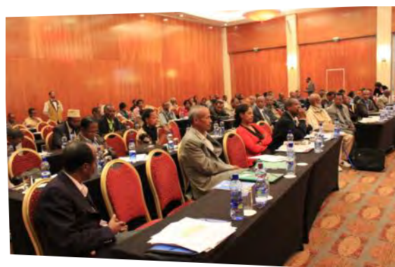
The national workshop in session.