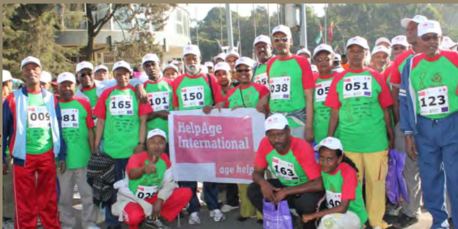
Group photo of participants taken before the starting of the Great Ethiopian Run 2012.

There were many other older men and women who successfully completed the race, received their yellow-ribboned medals and proudly went on home to share their accomplishments with their loved ones. I wonder how many older people the Great Run will bring together for children in 2013.