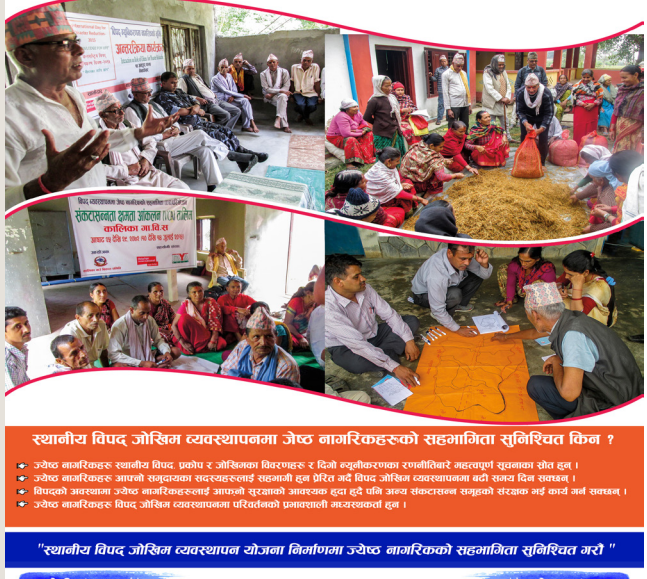
साउन्ग्रेजी संस्था HelpAge International age helps

ज्येष्ठ नागरिकको ज्ञान, सीप, अनुभव र क्षमताको पहिचान गरौँ । विपद् जोखिम व्यवस्थापनमा उहाँहरूको योगदानको कदर गरौँ ।