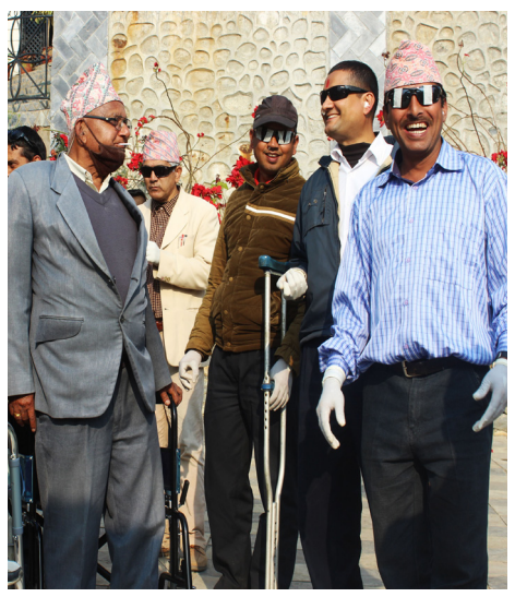
Participants during HOPE Simulation

The training concluded with commitments and Personal Action Plan of the participants to integrate older people's issues in their respective organisation's disaster response programmes.