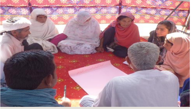
Older women and men with youth identifying local level measures that can minimise effects of any disaster in during a CBDRM training in district Muzaffargarh- Punjab Pakistan.

HelpAge has become a technical partner with Concern, ACTED, IRC and WHH for Building Disaster Resilience in Pakistan (BDRP) which is a five year programme aiming at implementing community based disaster risk management interventions in 32 districts across Pakistan. These 32 districts are declared as 'high risk' zone by the National Disaster Management Authority (NDMA). The total value of the program is GBP 60 million with GBP 220,000 for HelpAge.