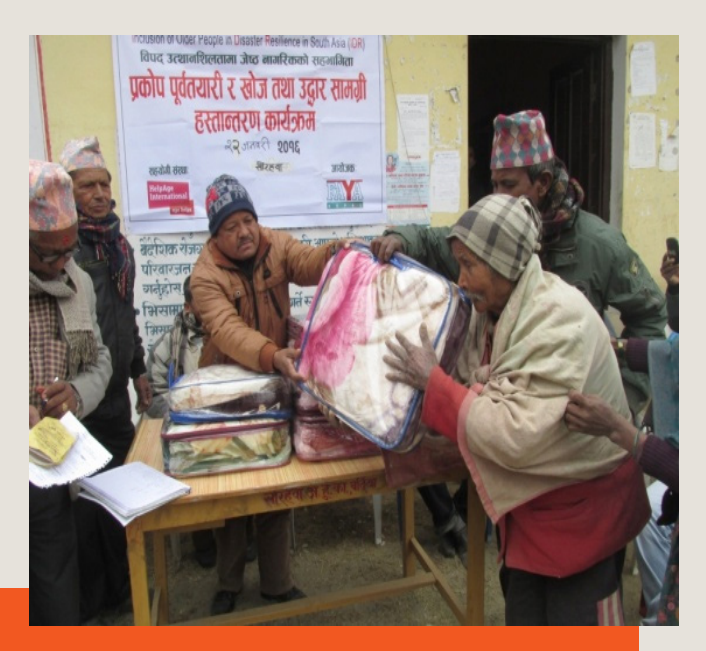
Older people in Kailali, Nepal receiving blanket from FAYA Nepal

In February 2016, Forum for Awareness and Youth Activity (FAYA) Nepal, a local implementing partner of HelpAge International Nepal at Bardiya and Kailai districts handed over preparedness and rescue equipment including assistive devices to older people in 10 villages. The devices include: shovel (plastic handle), rope (roll), buckets (10 liters), helmets, life jacket, emergency torch lights, head light, night vision jacket, safety boots, hearing devices and wheel chair.