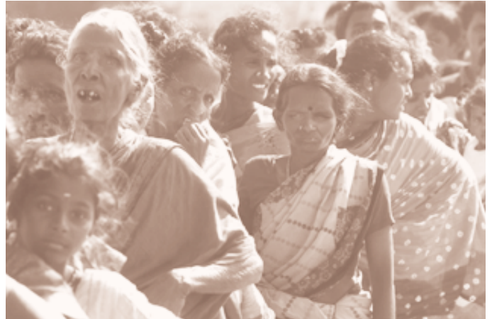
Older people should be included at all stages in the response

It can be used to raise awareness among relief agencies of older people's needs, and to help ensure that vulnerable older people receive adequate assistance.