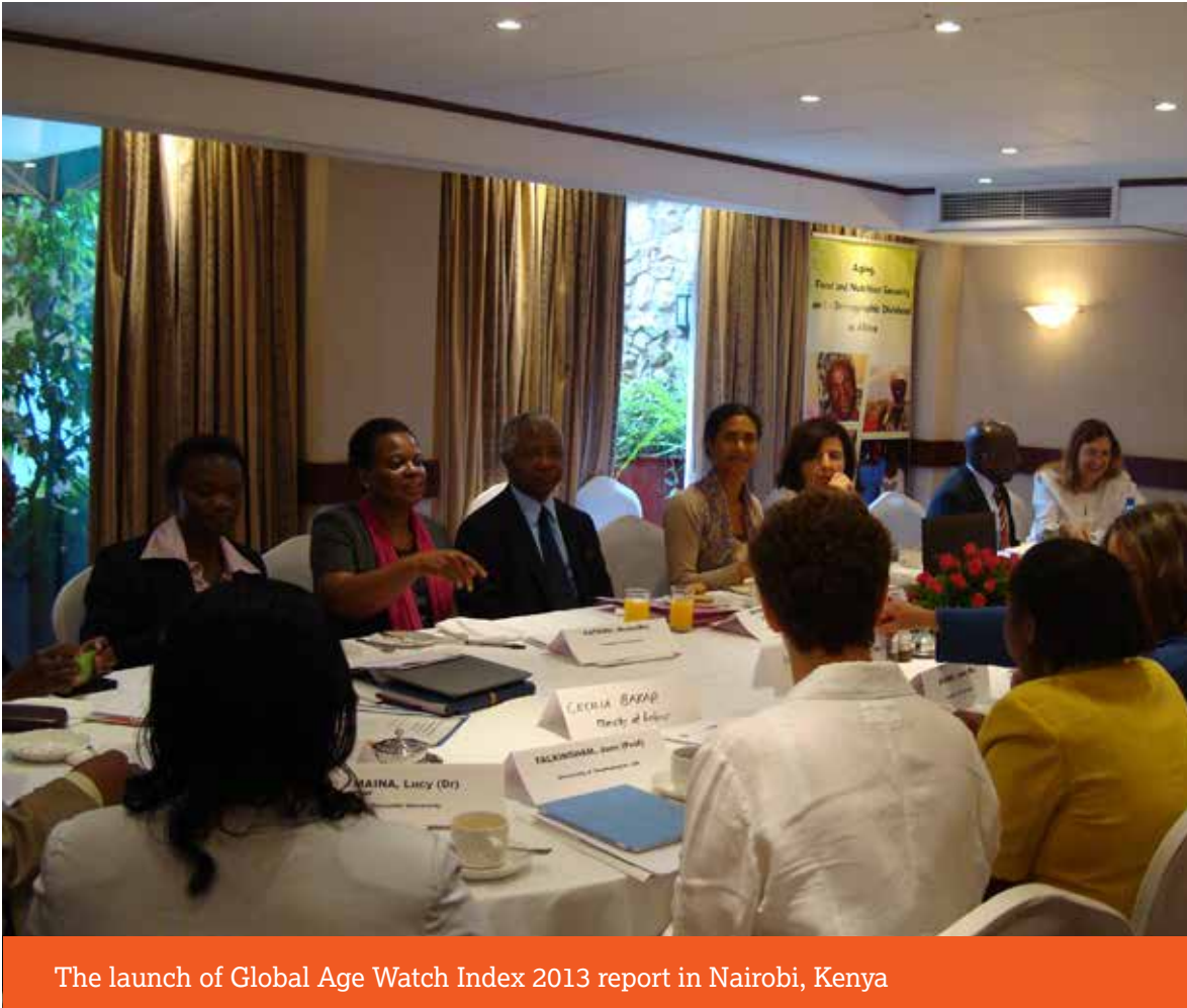
The launch of Global Age Watch Index 2013 report in Nairobi, Kenya

This index was developed with the support of UNFPA.