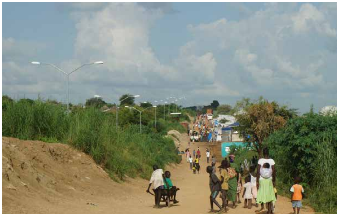
A street along the PoC 1 IDP site in Juba South Sudan

I didn't know what to expect and was worried about the security situation