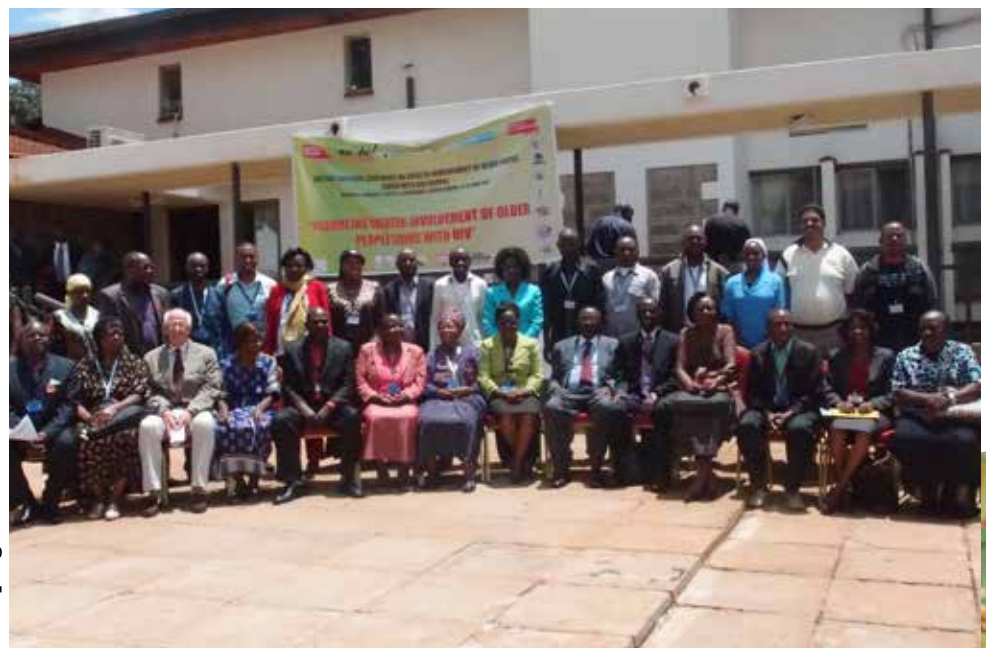
Participants of the first National Conference on Greater Involvement of Older People Living with HIV pose for a group photo

According to the 2012 Kenya Aids Indicator Survey (KAIS 2012), the HIV prevalence rate among older people aged 55-64 years increased to 4.2% from 3.3% in 2007.