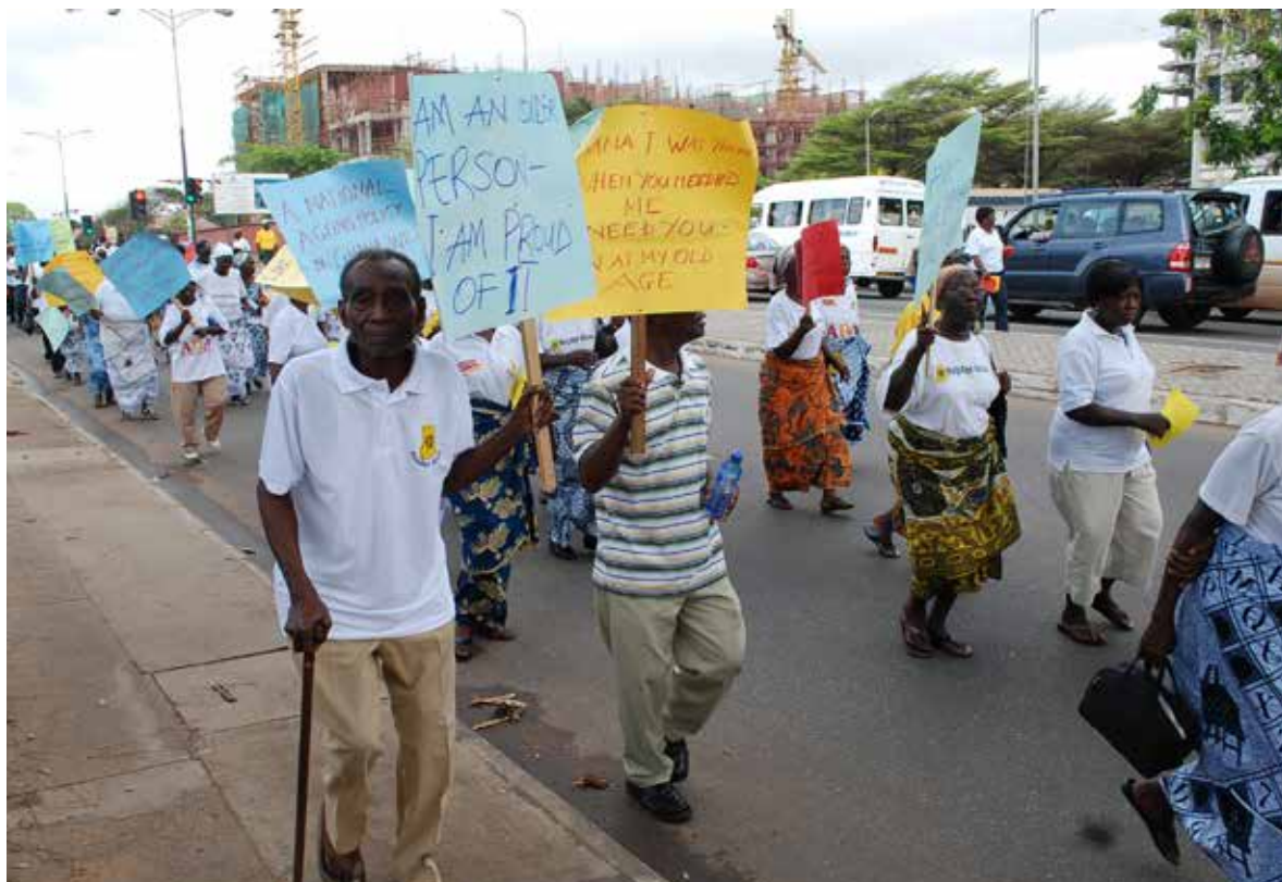
A group of older people take part in a demonstration to mark the International Day of Older Persons in Ghana.

ADA activists also wrote a petition paper in support of the UN Convention on the rights of older people