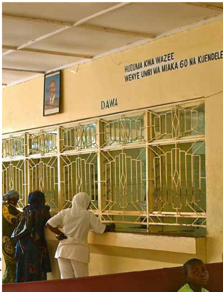
A health centre in Tanzania that has set aside a designated queue for older people

I was privileged to be at a summit of African First Ladies that was organized by the George W. Bush Institute in Dar es Salaam on 2-3 July 2013. The theme of the event was “Investing in Women; Strengthening Africa”.