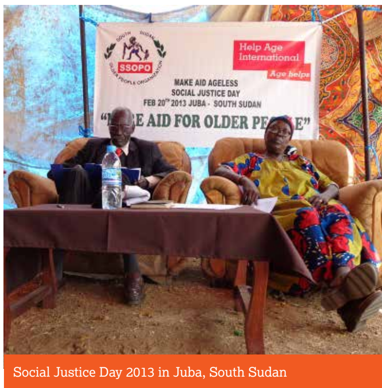
Social Justice Day 2013 in Juba, South Sudan

"I fought in the bush for seven years. Now I am fighting for older people rights."