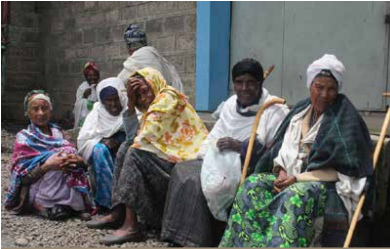
Older people at the Community Based Integrated Sustainable Development Organisation (CBISDO), Addis Ababa, Ethiopia

“Although at present the Government lacks sufficient resources to provide social protection to all those who are unable to work, various social protection and social security systems are under consideration,” states the Ethiopia National Plan of Action of Persons with Disabilities (2012-2021). The plan recognises that existing social security systems will need to be expanded to cover the increased number of beneficiaries, including persons with disability.