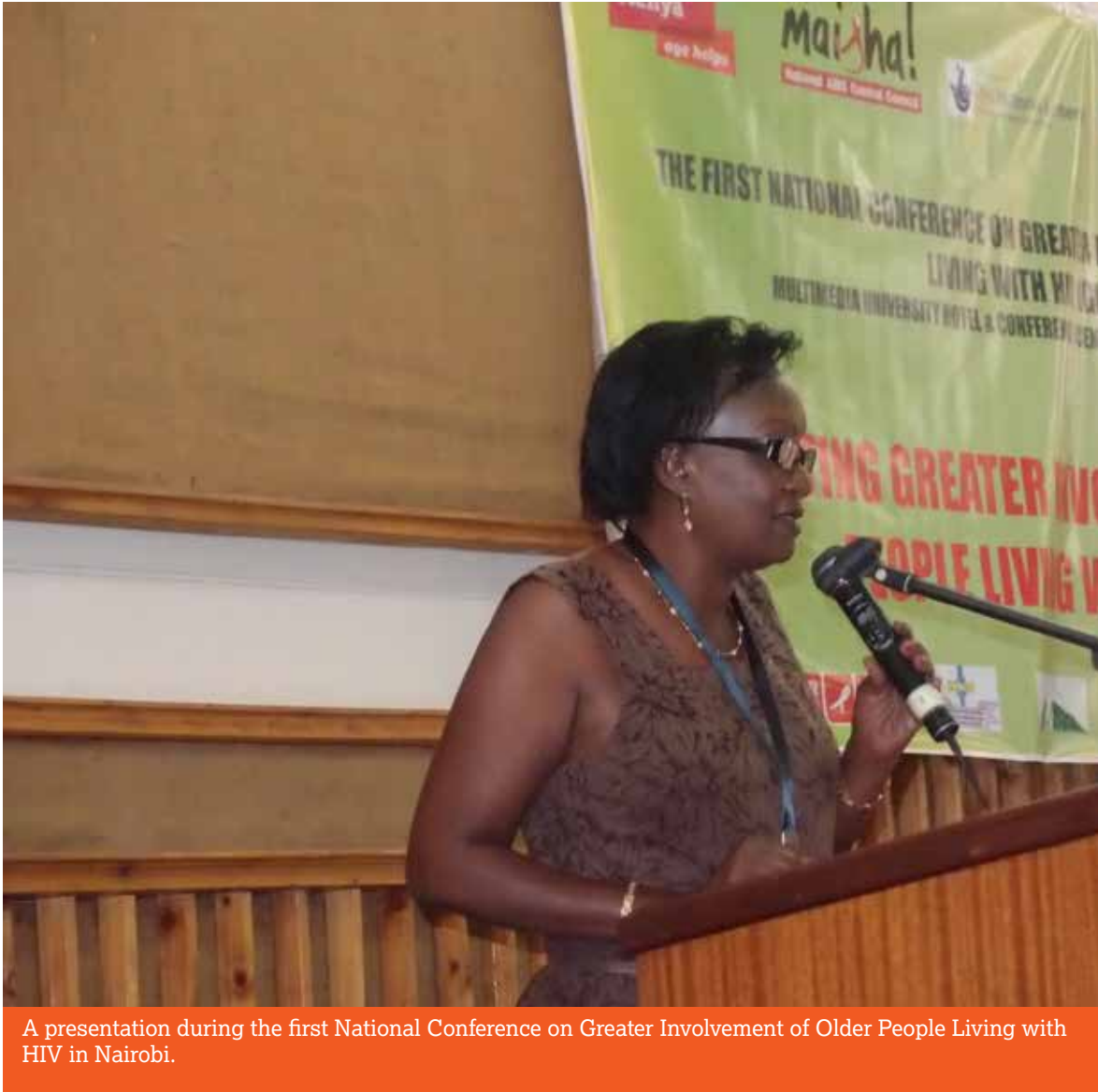
A presentation during the first National Conference on Greater Involvement of Older People Living with HIV in Nairobi.

A triangulation of methods was employed to collect requisite data for the study