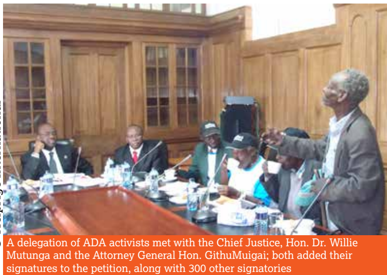
A delegation of ADA activists met with the Chief Justice, Hon. Dr. Willie Mutunga and the Attorney General Hon. Githu Muigai; both added their signatures to the petition, along with 300 other signatories