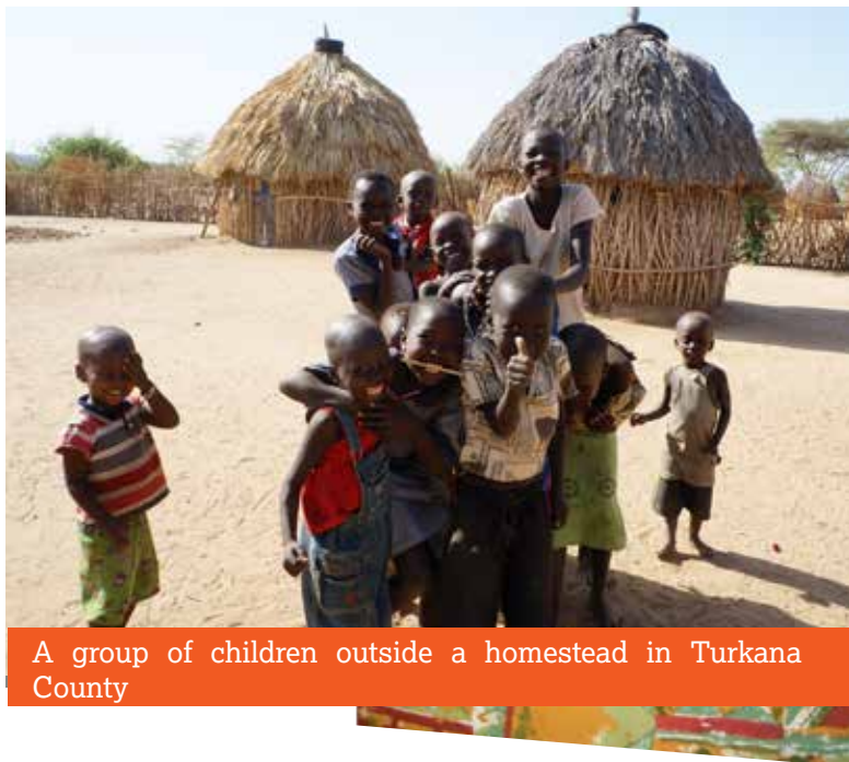
A group of children outside a homestead in Turkana County

The first phase of the HSNP programme helped me significantly. I used the money to buy some basic requirements like milk, meat, rice, vegetables and other essential necessities. I also used the money to pay for my grandchildren's fees at the Quran school. I at times also use the money to buy medication and purchase shoes and clothes for my grandchildren.