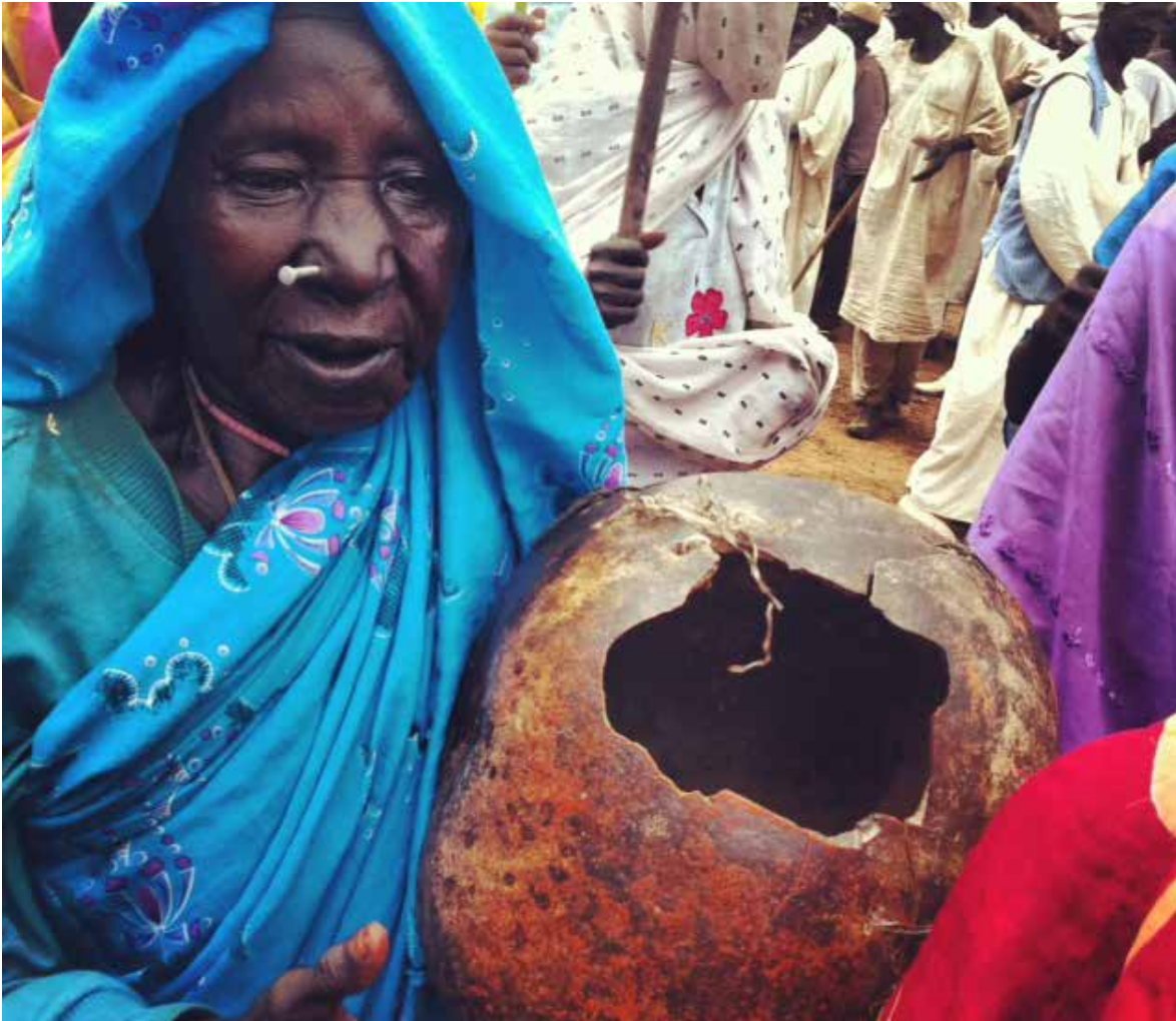
UN International Day of Older Persons in Maban, South Sudan.

The other event was an awareness raising workshop on older people and human rights in Ethiopia