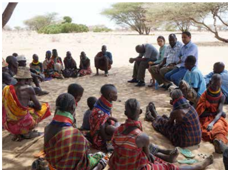
HelpAge staff meeting with Kakwanyang Village Rights Committee members in Turkana County.

The Hunger Safety Net Programme (HSNP) is an innovative social cash transfer programme that is intended to benefit some of the 1.5 million Kenyans (5% of the population) who are chronically food insecure and depend on emergency relief to meet their basic needs. In 2013, HelpAge International, HelpAge Kenya and the Advocacy group on Social Protection and Livelihoods continued to advocate for increased coverage of the Older People Cash Transfers (OPCT). As a result the government has increased social welfare grant to 12 billion Kenya Shillings and will be reaching 450,000 beneficiaries. Here are some examples of the difference the HSNP makes in the lives of older people and their dependants.