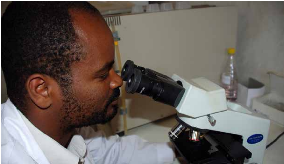
The Family Guidance Association of Ethiopia is a local Ethiopian NGO that provides sexual and reproductive health services focussed on youth and works closely with TESFA to deliver HIV counselling and testing facilities for older people in Addis Ababa, Ethiopia

“Treatment is not a pill, it must be delivered with dignity and respect.”