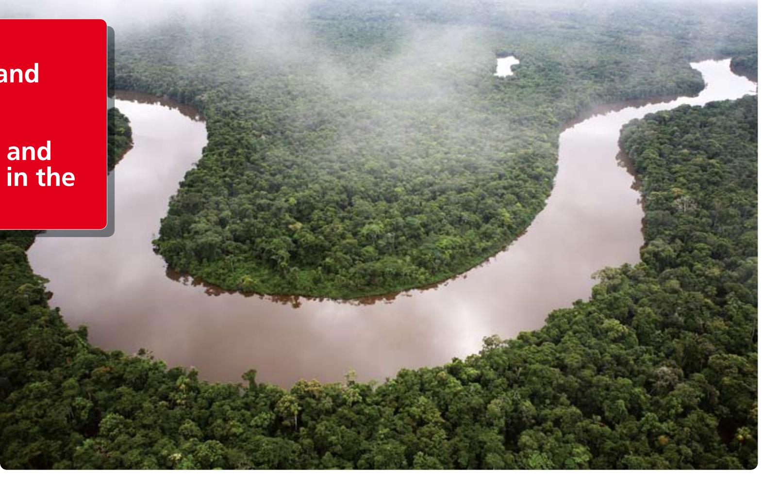
▲ Aerial view of the Peruvian Amazon.

This WWF-supported initiative involves assessing carbon stocks in the department of San Martín, the most deforested area in Peru. The goal is to quantify the carbon storage potential of twelve types of natural forests, including natural protected areas, communal territories and forestry concessions in a region that suffers the threat of deforestation and degradation.