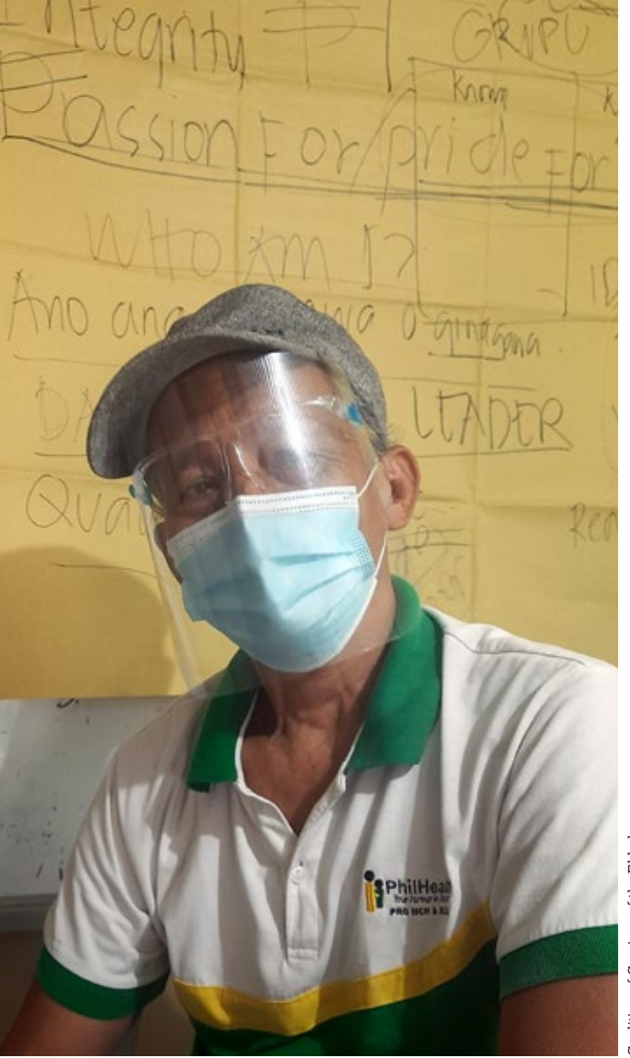
Coalition of Services of the Elderly

"It has been a tremendously long quarantine. We're all very tired. We older people have suffered a lot. What has not been taken into account is the psychological damage this pandemic has caused and the problems we're going to have in the future." 64-year-old woman living with her spouse in a rural area, Argentina