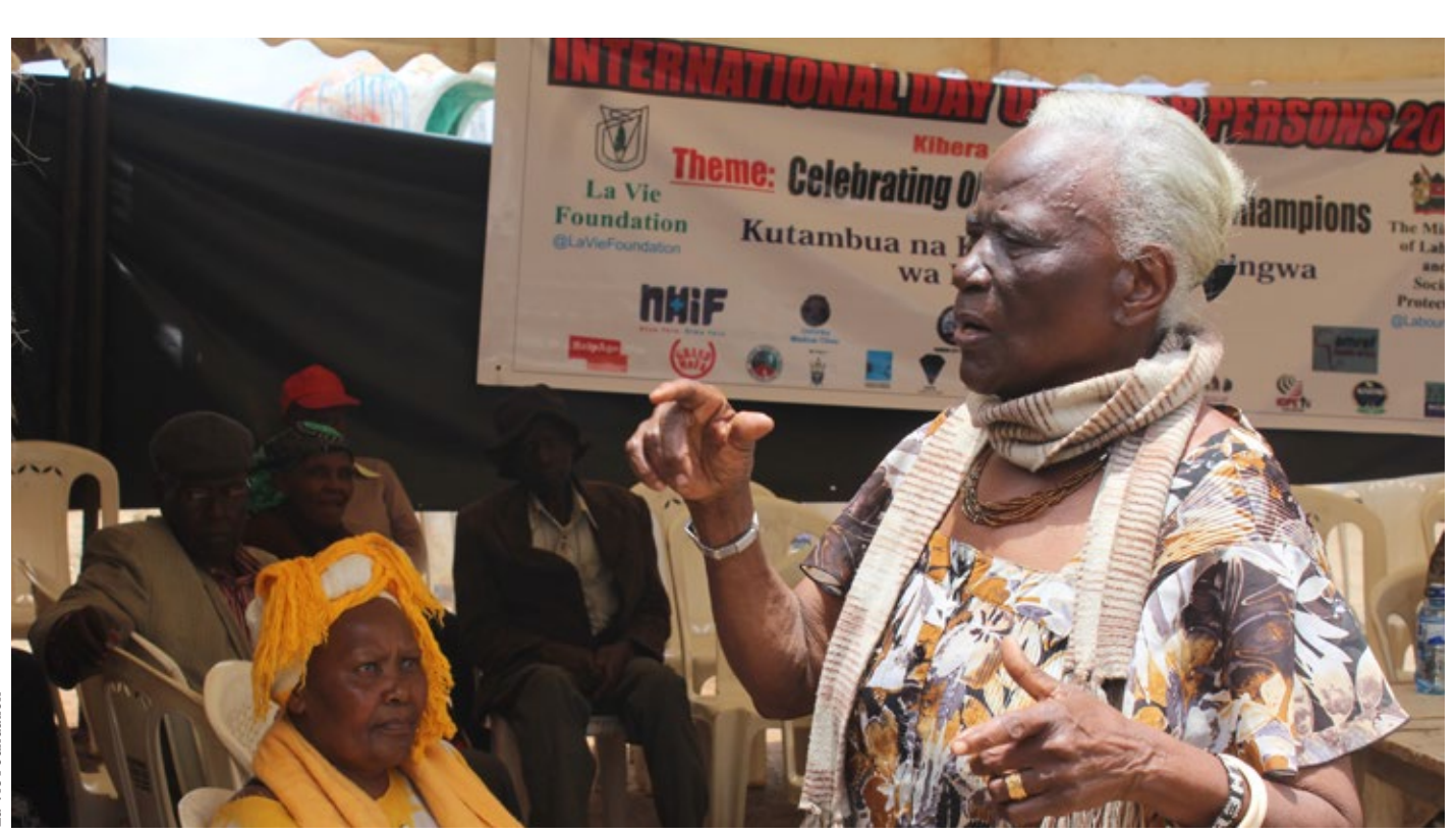
a Vie Foundation

90-year-old woman, former community volunteer living alone in an urban area, Canada