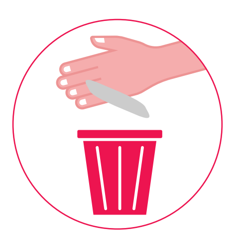
Put tissues in the bin