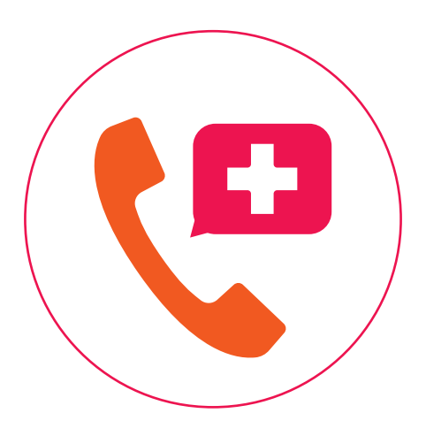
If you feel unwell seek medical help

Ask friends, family or carers for help with picking up medicines or food