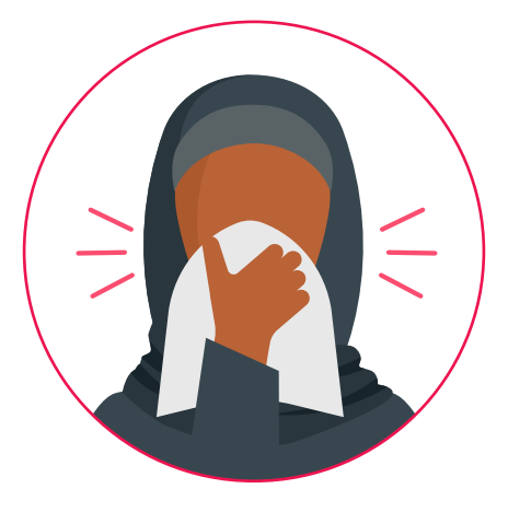
Cough or sneeze into a tissue