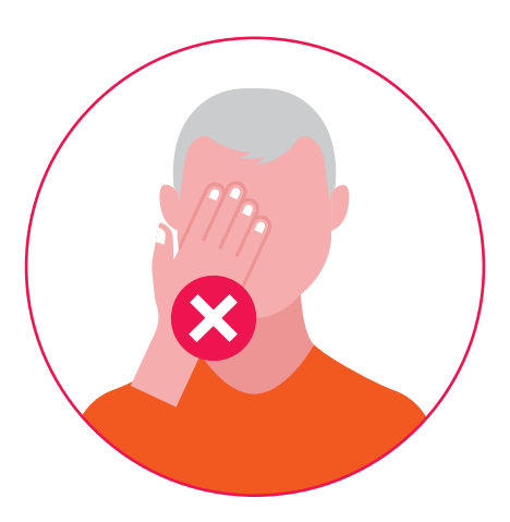
Don't touch your eyes, nose and mouth

Regularly wash your hands with soap and water for at least 20 seconds