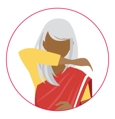
If you don't have a tissue, cough or sneeze into your sleeve