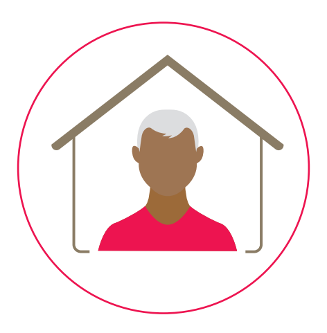
Stay at home as much as possible