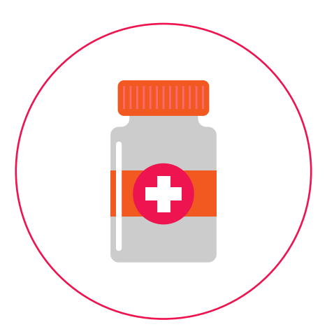
If you have other health conditions, make sure you have a longer supply of your medicines than usual