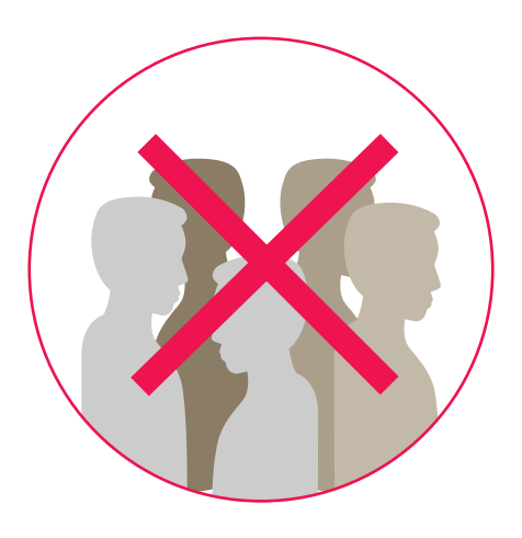
Avoid big groups of people