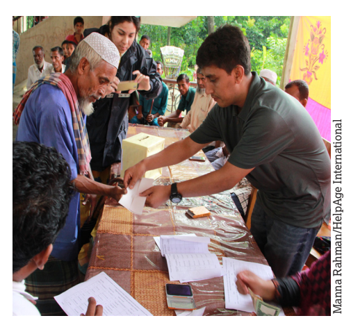
HelpAge staff (right) collecting thumbprint (substitute for signature) of older people during cash transfer.

needs. Older people expressed their gratitude for HelpAge and BITA, and also shared their plans to repair house, buy foods, cloths and medicine from the grant received.