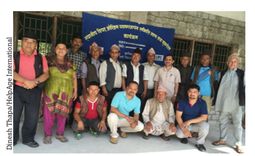
Community Disaster Management Committee (CDMC) formation in Mahankal, Sindhupalchowk.

parties and organisations working in DRR in each committees. It's been presumed that inclusion of older people in the committee will help address vulnerabilities/capabilities of aged community members while conducting Vulnerability and Capacity Assessment.