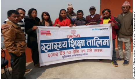
Participants in Geriatric Health Training at Dhulikhel, Kavrepalanchwok.

Community Health Workers and Counselors operating under Nepal Earthquake Response Project (NERP) in Kathmandu, Bhaktapur, Nuwakot, Kavrepalanchwok and Sindupalchwok districts of Nepal were provided trainings on Geriatric Health in post-emergency context, from April-June 2016. The trainings basically aimed at enhancing service provider's knowledge so that they can effectively deliver general health services, psychosocial care to older people, and orient frontline community workers and local stakeholders in post-earthquake.