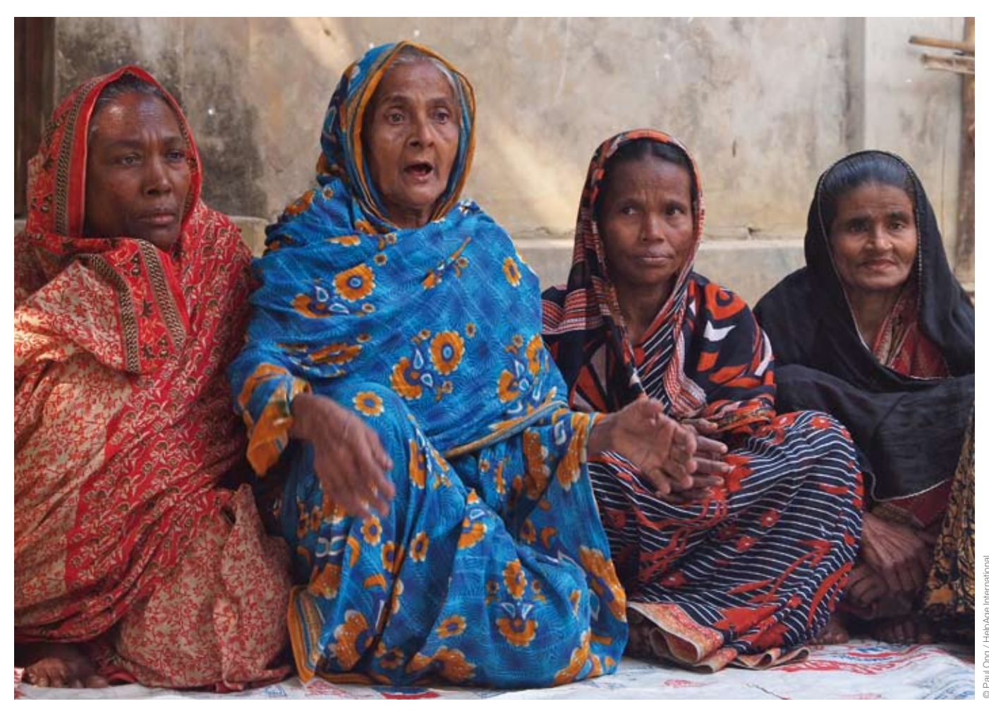
Older people and people with disabilities and are often prevented from speaking freely about the issues affecting their lives.