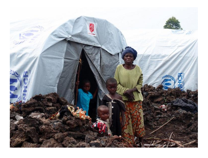
A grandmother and her grandchildren in a camp in DRC, 2012

In both cases these figures hide regional differences. In Africa, for example, children under five make up 14.9 per cent of the population while those 60 and over make up 5.6 per cent.<sup>3</sup> If we investigate