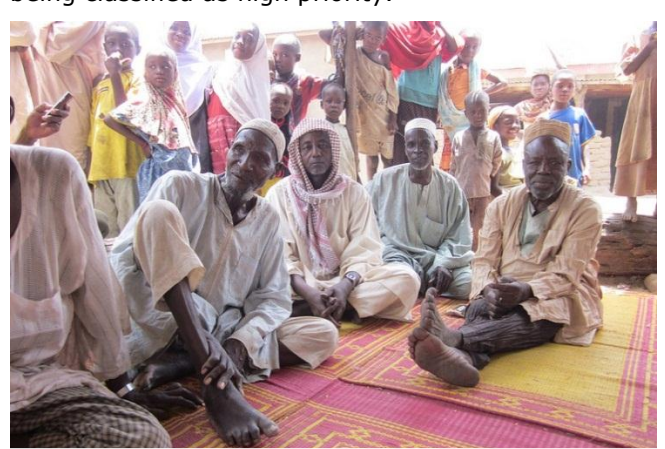
Older men meeting in Guite, Massaguet District, Hadjer-Lamis Region, Chad, 2012

Assessment for Haiti (RINAH) conducted by ACAPS,<sup>5</sup> for instance, indicated that older people were the most vulnerable group affected by the earthquake. Yet, in 2011, only seven project proposals submitted to the CAP in Haiti included activities that targeted older people, and none were funded, despite five being classified as high priority.