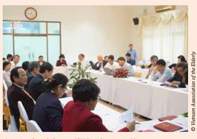
A national workshop on ISHC replication in Vietnam

From 2008, many stakeholders have visited and learned about the model, including an array of government representatives with a focus on MOLISA and Ministry of Health at local, district, provincial and national levels, the National Committee on Ageing and members of the National Assembly. Sharing the model and evidence of its impact and sustainability has led to participation by a growing number of implementing partners and funding sources and strengthened the political