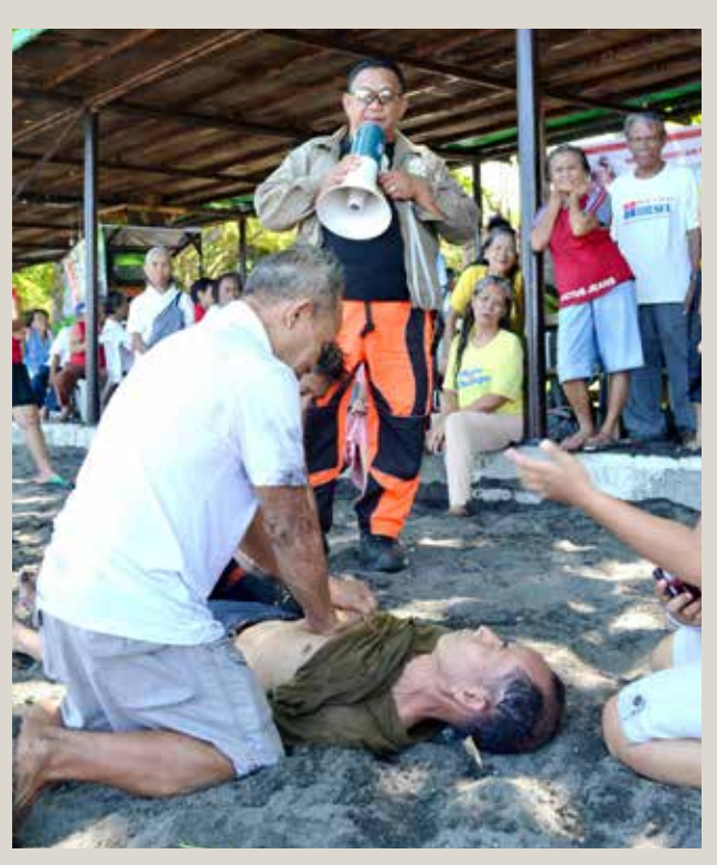
First aid and CPR training in the Philippines