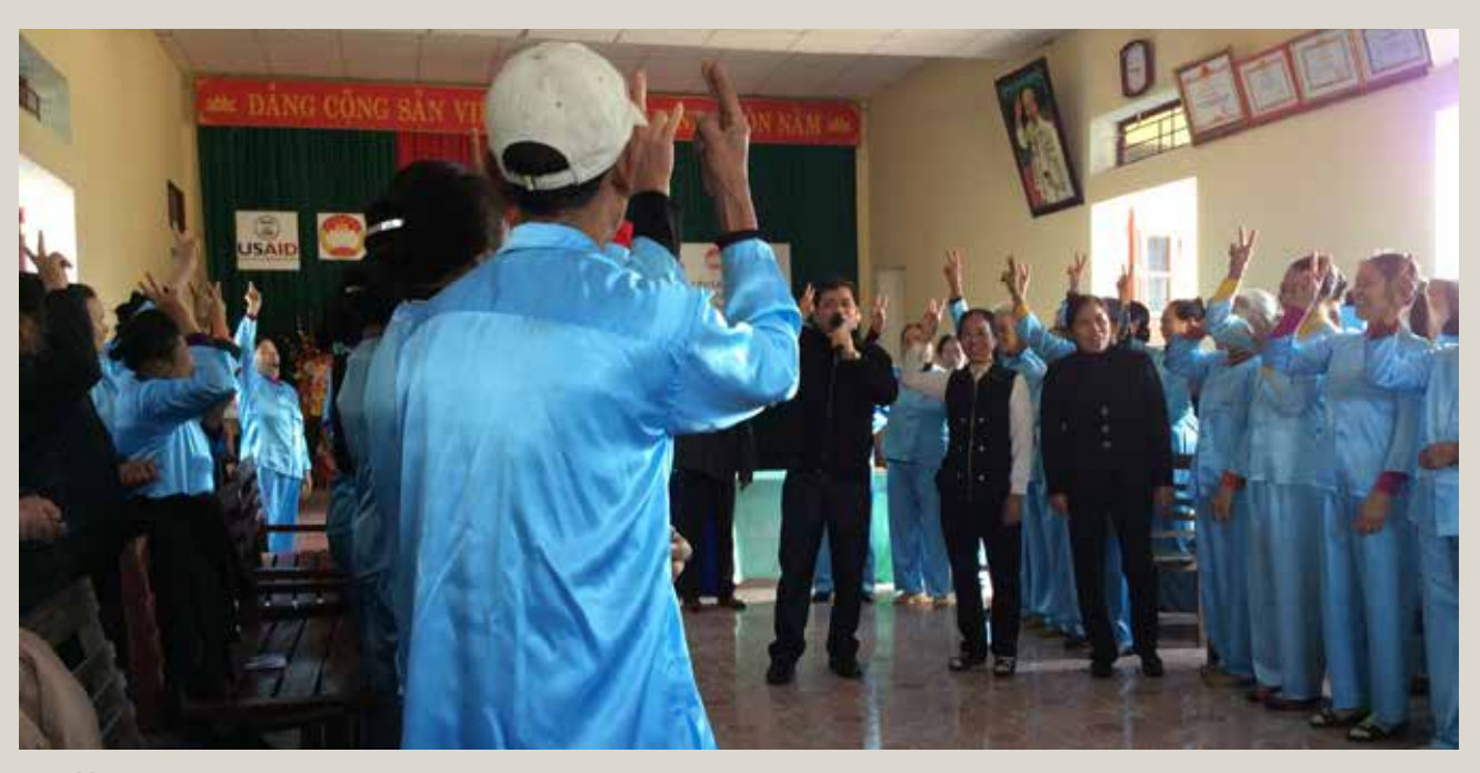
Monthly meeting in Vietnam