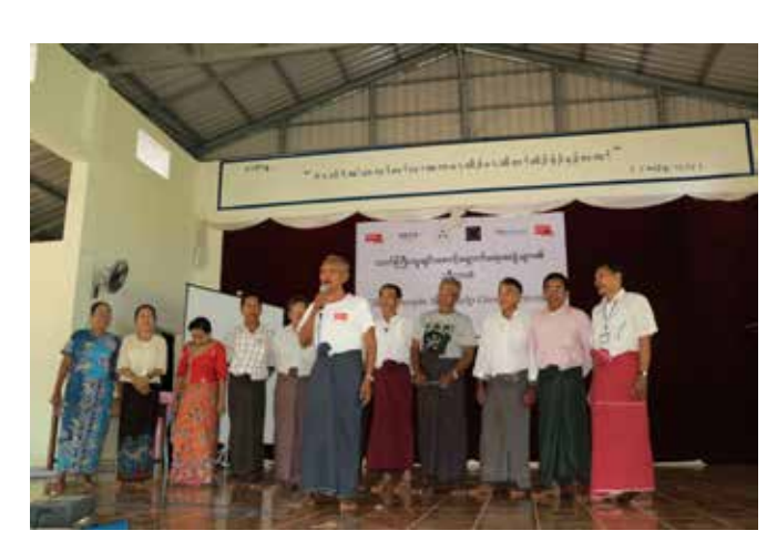
The National Older People's Federation of Myanmar meets to discuss social protection advocacy strategy and annual plans for Township Network Committees