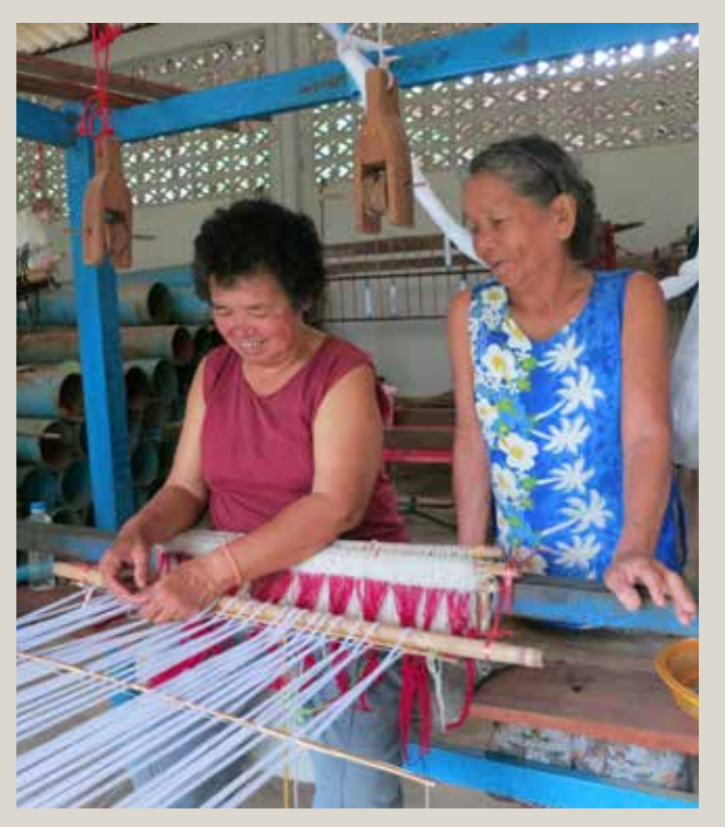
Weaving - a livelihood activity in Thailand