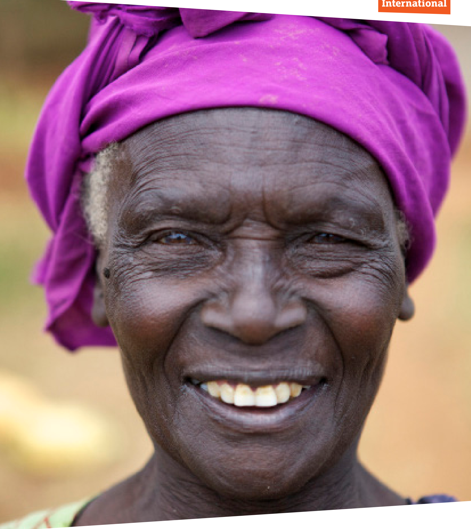
Equality for women of all ages