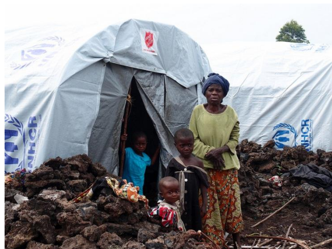
A grandmother and her grandchildren in a camp in DRC, 2012

In both cases these figures hide regional differences. In Africa, for example, children under five make up 14.9 per cent of the population while those 60 and over make up 5.6 per cent. 3 If we investigate