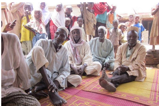
Older men meeting in Guite, Massaguet District, Hadjer-Lamis Region, Chad, 2012

Assessment for Haiti (RINAH) conducted by ACAPS, 5 for instance, indicated that older people were the most vulnerable group affected by the earthquake. Yet, in 2011, only seven project proposals submitted to the CAP in Haiti included activities that targeted older people, and none were funded, despite five being classified as high priority.