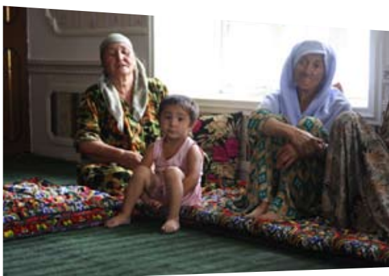
Alois Schaeffer/HelpAge International