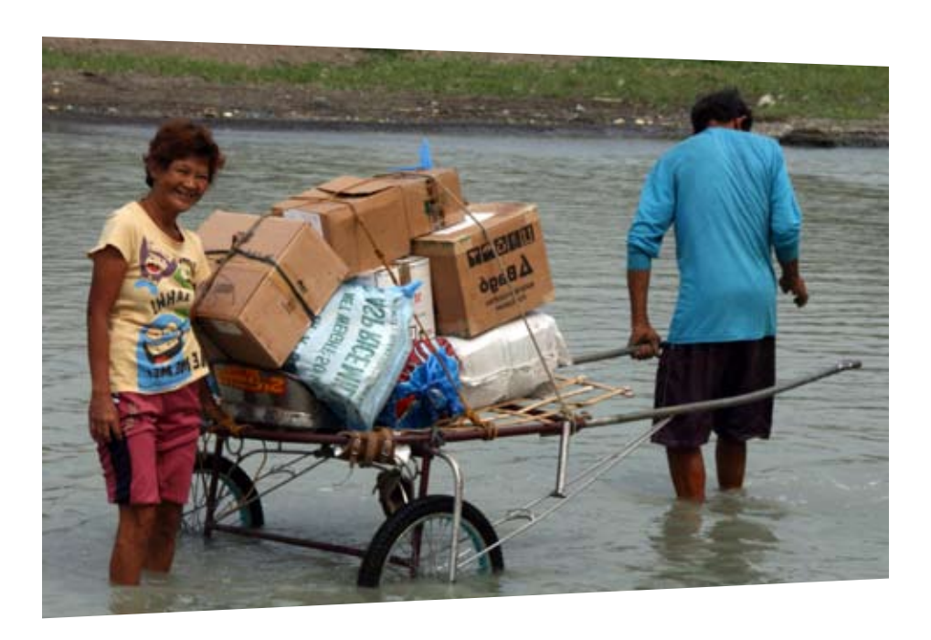
OPA members in Bagong Silangan cart supplies to a medical mission. The same organisation is coordinating village DRR activities

sponsored by COSE, COPAP has held training sessions on disaster management and formed disaster committees in each area.