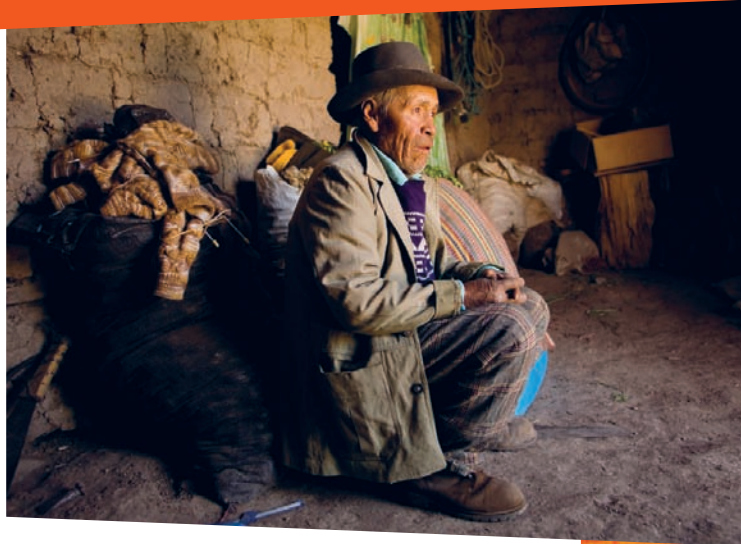
Older people living in poverty are among those most at risk of non-communicable diseases.