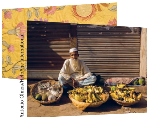
Antonio Olmos/HelpAge International

The evidence suggests that cash transfers and pensions offer vital support for older people and can help them to