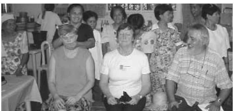
Relaxing welcome for Dutch visitors to the Philippines.

Exchange visits between older people's organisations in the Netherlands and the Philippines have helped to create a bond of solidarity.