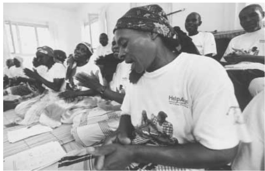
Older people train to become volunteer home visitors in Mozambique.

Educating older people about HIV/AIDS is essential for reducing the risks to the whole community. Here are some ideas.