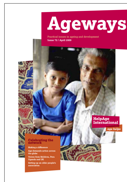
Picture only on front cover