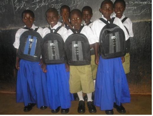
Figure 1: Picture showing (left) an OPMF session and OVC beneficiaries (right). Gender considerations are one of the underlying principles in project implementation.