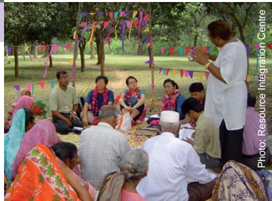
Members of HAI network visited the Older Citizens Monitoring (OCM) project in Bangladesh

The participants commented that the training was their first opportunity to gain a greater understanding of the health issues of older people, and it gave them ideas about how to provide better health services for older people.