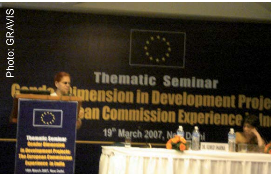
19 Mar 07, India: GRAVIS participated in the EU's thematic seminar on 'Gender dimension in development projects: European Commission experience' in New Delhi