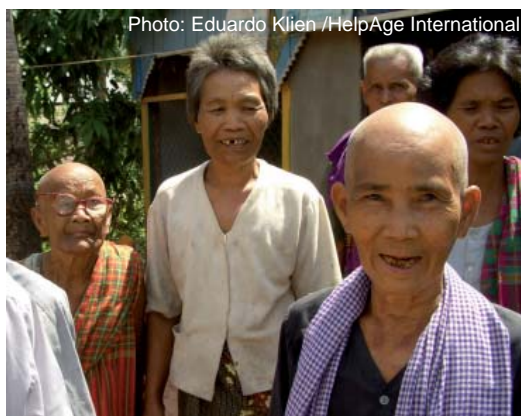
Older people are among the poorest in many societies

By 2050, more than one in five people will be aged over 60, thanks to falling fertility rates and longer life expectancy. According to UNDESA, nearly 80% will live in developing countries. HelpAge International estimates that 100 million older people now live on less than US$1 a day and this figure will continue to rise.