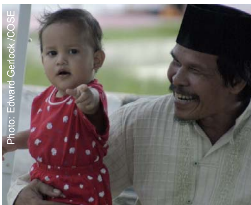
Like children, older people have specific health needs