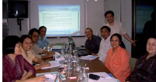
On 24-25 April 2007 the APRDC hosted a 'Health working group' meeting in Chiang Mai, Thailand